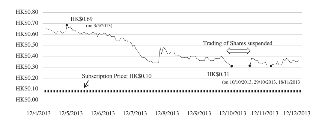
Chart 1. Share price of the Company